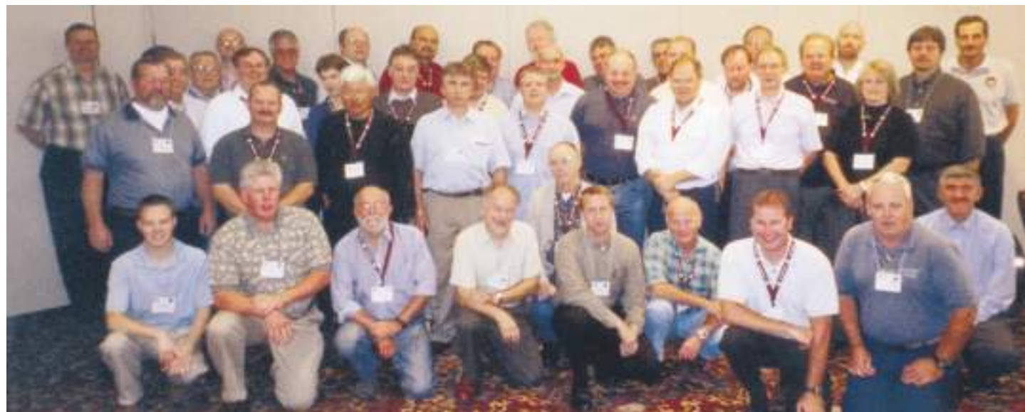
A rare event indeed is captured by this photograph, that is, the auditors, staff and the Task Group members all together in one place at one time. This photo was taken at the October 2003 Auditor Training Session held in Pittsburgh Pennsylvania.